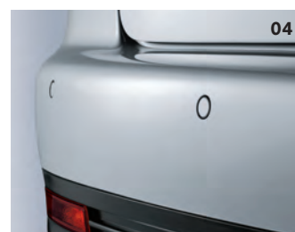
04 Rear parking sensors.

Safety and security have to be a primary consideration, for only when you are feeling totally safe and protected can you completely relax. For example, the rear parking sensors take the worry out of reversing into tight spaces, enabling you to enjoy the driving experience so much more.