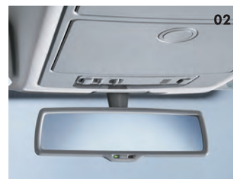
02 Automatic dimming interior rear-view mirror (Convenience pack).

The importance of comfort and convenience cannot be over-emphasised. Choose from this range of factory-fitted options to create an interior that meets your individual needs, and makes life just that little bit more comfortable and convenient. 2Zone electronic climate control, electric sunroof or Convenience pack, these luxuries are designed to help you relax and take the stress out of driving, adding not only a touch of luxury, but also providing invaluable practical assistance.