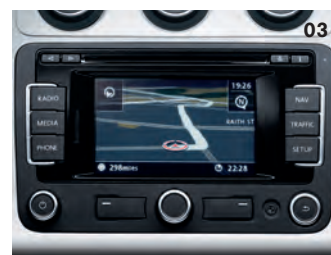
03 RNS 315 touch-screen navigation/radio system.

When it comes to in-car entertainment systems and communications packages, those looking to install a technologically advanced or upgraded system are spoilt for choice. Whether you require the latest touch-screen navigation system or digital radio receiver, these factory-fitted options provide the ultimate in advanced electronics, state-of-the-art technology and connectivity.